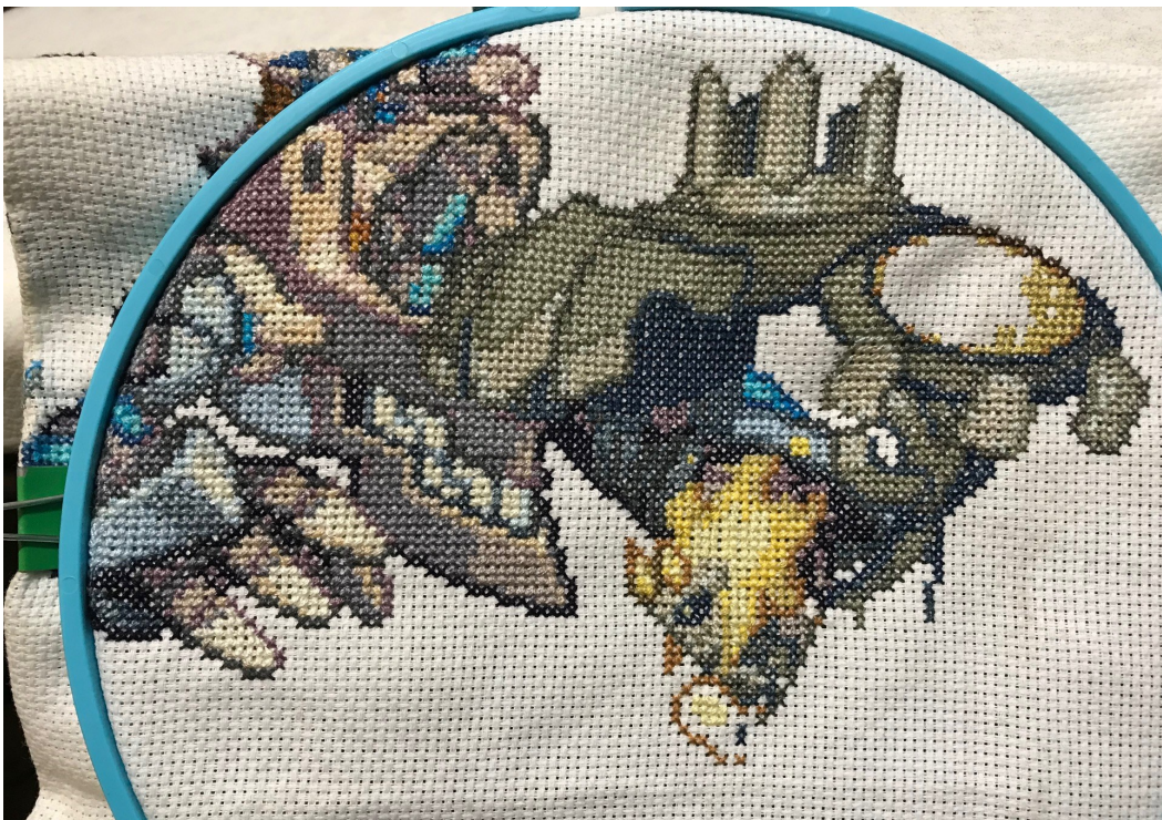
Work In Progress Cross Stitch By Laura